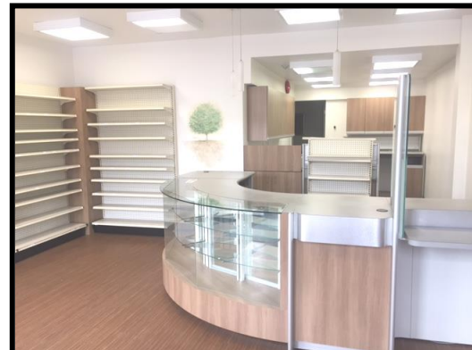
1808 W Broadway

The information contained herein has been gathered from sources deemed reliable, but is not warranted as such and does not form any part of any future contract and may be altered or withdrawn at any time without notice. This information is not intended to induce the breach of an existing agency relationship.